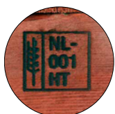
The marking on the Heat Treated pallet