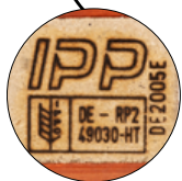
The marking on the Heat Treated pallet