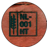
The marking on the Heat Treated pallet